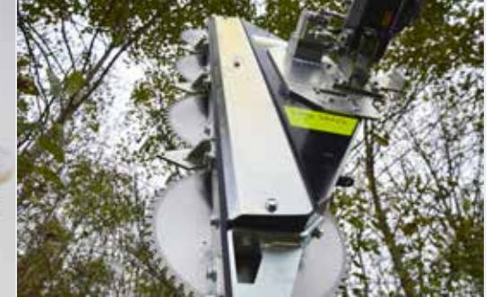
Quadsaw LRS 1602