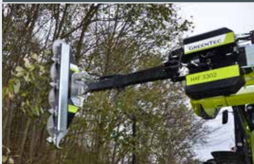
Quadsaw LRS 1602