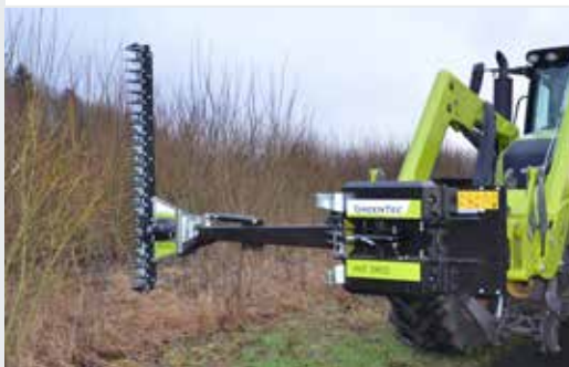
Cutterbar HL 182 & 212