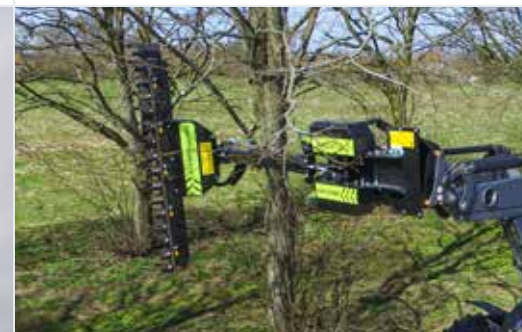
Cutterbar HX 170 - 270