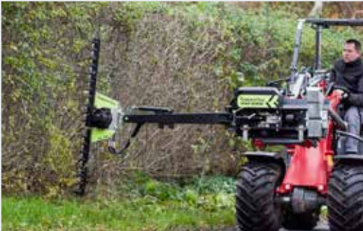
Cutterbar HL 152