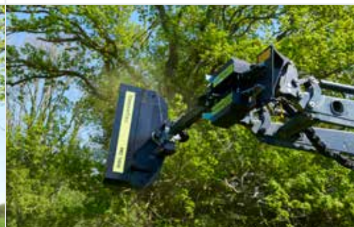
Rotary Hedge Cutter RC 162