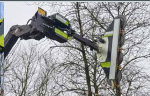
Quadsaw LRS 2402