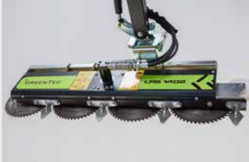
Quadsaw LRS 1402