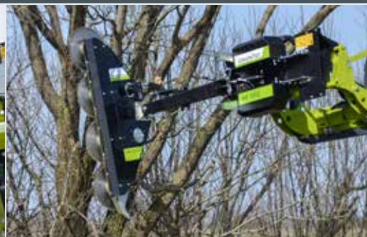
Quadsaw LRS 2002