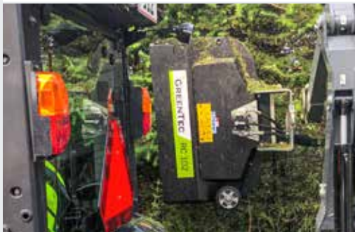
Rotary Hedge Cutter RC 102