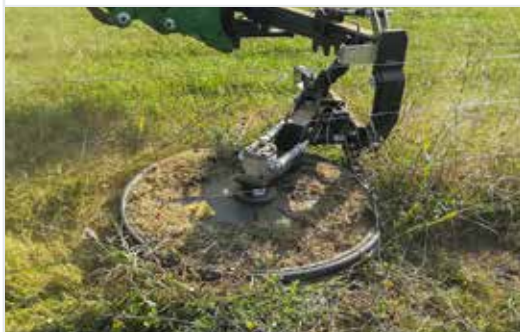
Barrier Mower RI 60 & 80