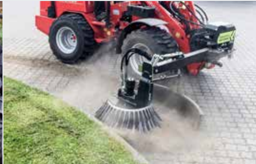
Weed Clearing Brush BR 70