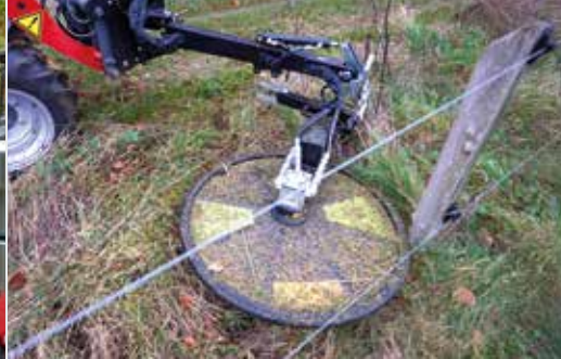
Barrier Mower RI 60 & 80