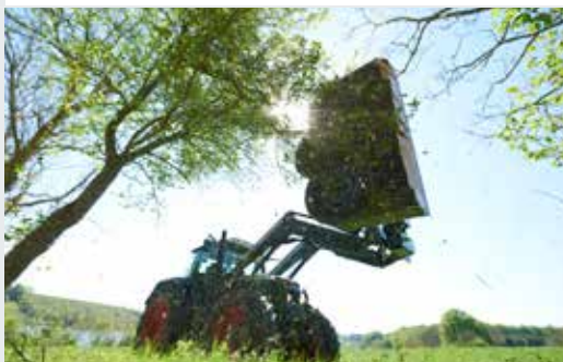
Rotary Hedge Cutter RC 132