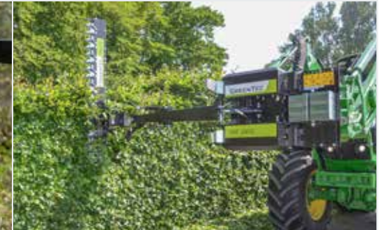
Cutterbar HS 172