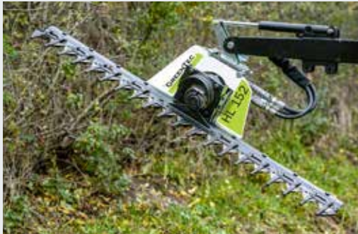
Cutterbar HL 152 - 212