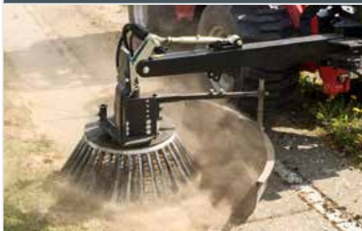
Weed Clearing Brush BR 70